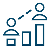
Advancement Training & Development