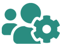
Work Ready Credential